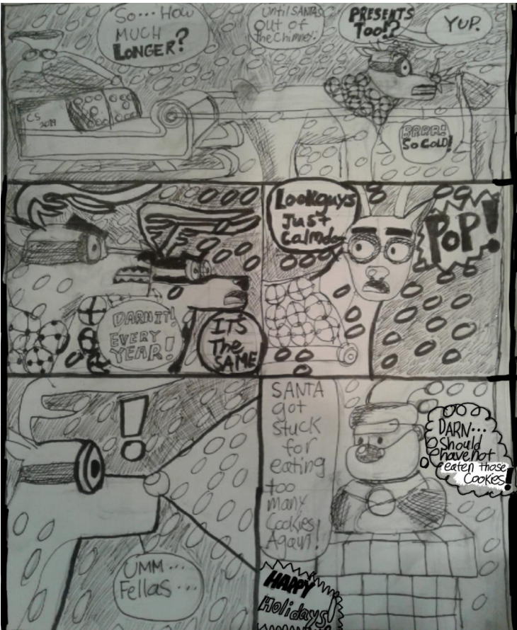
Comic by Connor Sturza